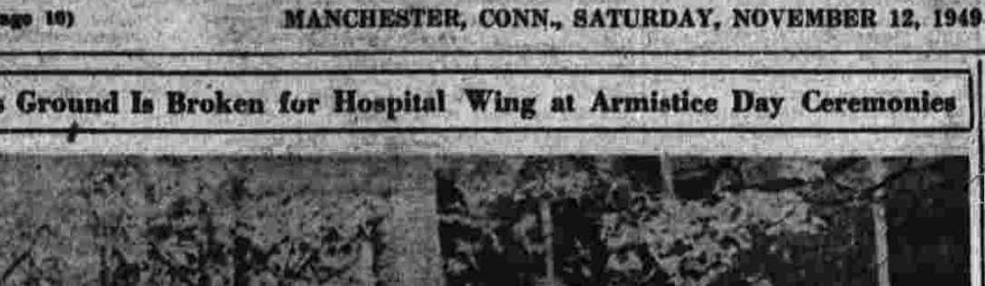
The ground was broken for the addition of another wing to the Memorial Hospital...